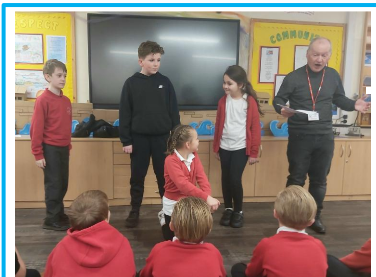
YoYo's drama and poetry workshop this morning with Sycamore Class.